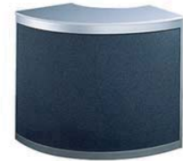
4041 - 1M x 40" Curved Counter (open back)